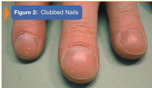
Figure 2: Clubbed Nails

The finger nails may develop an unusual clubbed shape ( see Figure 2 ) with some heart or lung diseases.