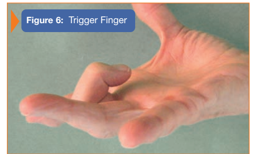
Figure 6: Trigger Finger

Diseases of the hormones (endocrine system), may result in changes of tendon and ligament tissue. Diabetes is a known cause of "trigger finger" ( see Figure 6 ), in which the finger may be temporarily locked in the flexed position, often with pain.