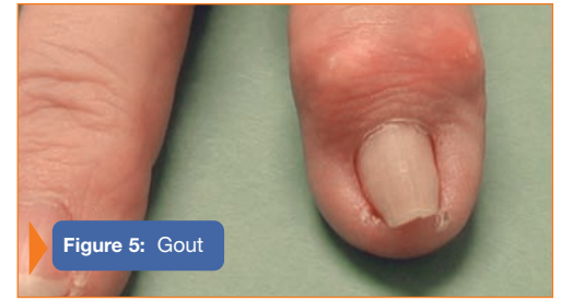
Figure 5: Gout

Gout, a disease of uric acid metabolism, may present as a yellowish-white nodule on a digit ( see Figure 5 ). The skin may become thin to the point of draining and thus be confused with an infection, especially if there is an acute, painful attack of the gout. Severe bone changes may exist beneath the skin. In this case, there is also a nail deformity characterized by a severe curvature, called a "pincer nail". This can cause pain and ingrowing of the nail.