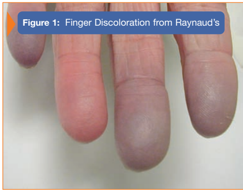
Figure 1: Finger Discoloration from Raynaud's

Raynaud's phenomenon (temporary spasm of the arteries in the fingers, resulting in coolness and bluish/purple discoloration – see Figure 1 ) may occur with rheumatoid arthritis, systemic lupus, and scleroderma, to name a few. If the condition is more severe, fingertip ulcers may result from the poor circulation.